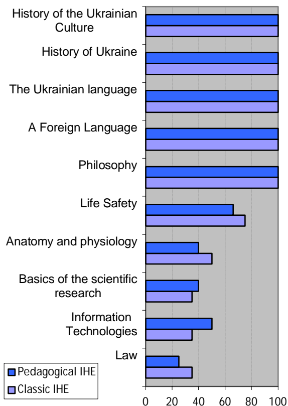
Diagram 1. Common compulsory general educational components of bachelor's degree in choreography of educational and professional programs of classical and pedagogical IHEs (%)

professional training in classical institutions of higher education are the following: Laboratory of Stage Repertoire, Fundamentals of Intellectual Property, Professional and Corporate Ethics, Creative Phenomenon of Lesya Ukrainka, Literary basis of choreographic works, Analysis of ballet performances and choreographic forms, Fundamentals of medical knowledge, Choreography in sports, Ground floor exercise, Fundamentals of ecology, Academic integrity, Dance therapy, Management of art projects and others.